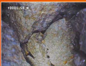
HIGH INTENSITY LIGHTING SYNCHRONIZED DUAL CAMERA SYSTEM