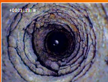
DOWN VIEW CAMERA